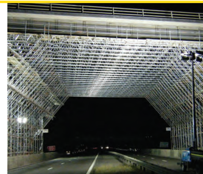
Photograph: Wadworth Viaduct. Courtesy of Pyeroy Limited.

THE COMPLETE SYSTEM FOR SUSPENDED AND BRIDGED ACCESS